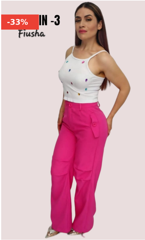
PANT LIN 3 FIUSHA.