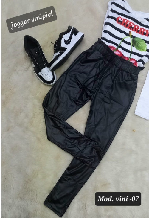
JOGGER VINI-07 UNITALLA (30 A 34).