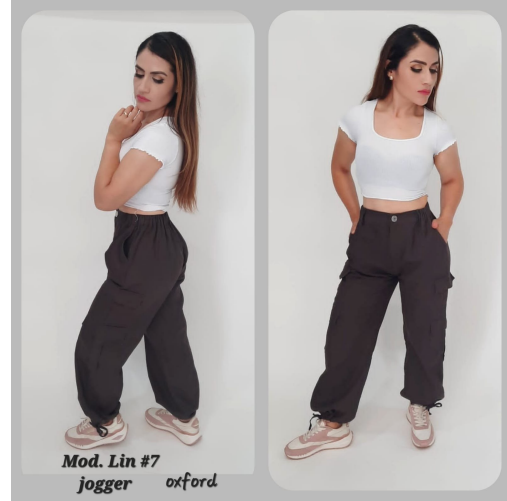
PANTALON LIN 7 OXFORD.